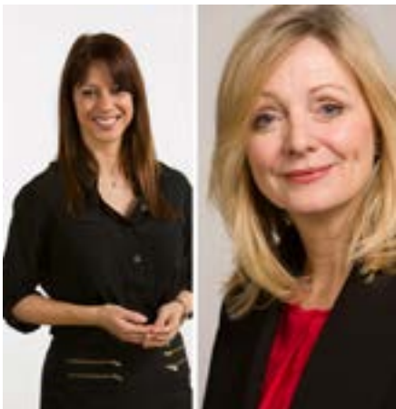
GLORIA DE PIERO MP

“IT’S NOT ENOUGH BEING TALENTED, THESE DAYS YOU NEED CASH.”