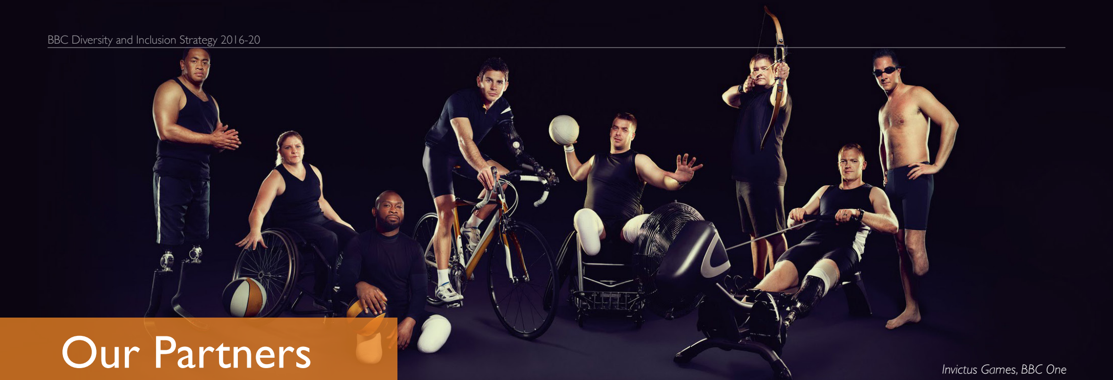
Invictus Games, BBC One