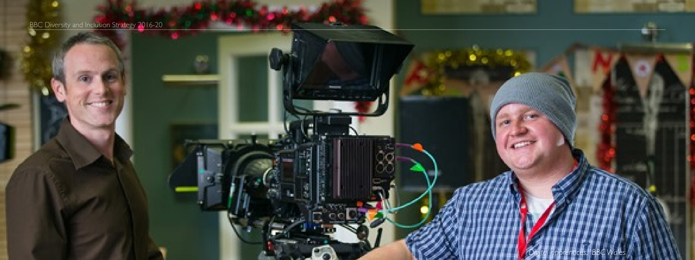
Digital apprentices, BBC Wales