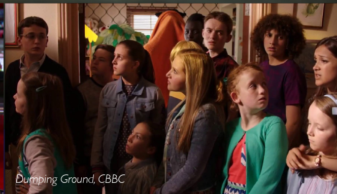
Dumping Ground, CBBC