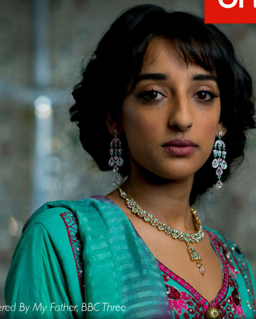
Murdered By My Father, BBC Three

On TV, BBC One is the UK's most popular channel across all demographics.