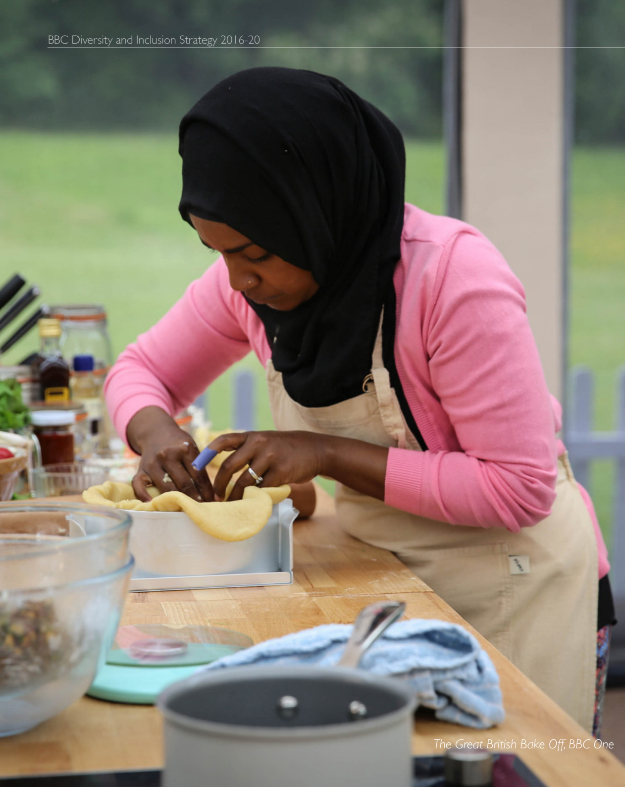
The Great British Bake Off BBC One