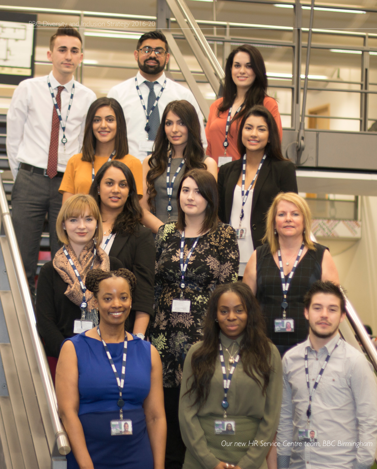
Our new HR Service Centre team, BBC Birmingham